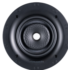
VX66R TL SKU 93651 PAIR