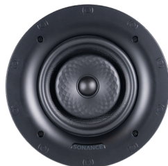
VX62R SST TL SKU 93653 EACH