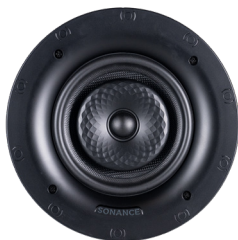
VX62R TL SKU 93650 PAIR