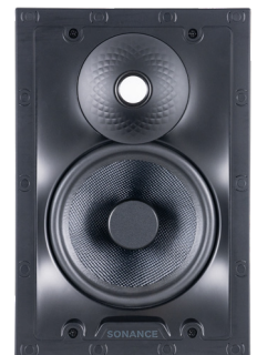
VX66 TL SKU 93652 PAIR